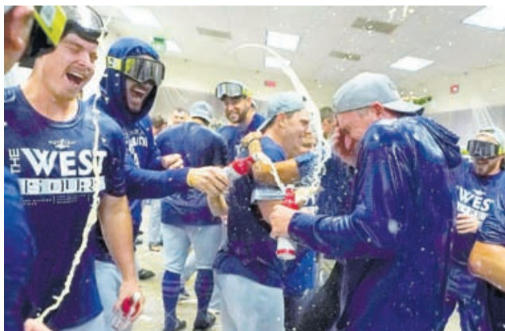
Los Angeles Dodgers celebrate in the locker room after a 4-0 win in a baseball game against the Arizona Diamondbacks in Phoenix, Tuesday, Sept. 13, 2022. The Dodgers clinched the National League West.

The Dodgers walked from the dugout when it was over to congratulate each other, much like they did after most of their wins in a runaway season, and posed for a team photo on the field.